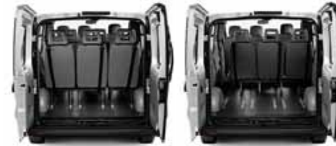
The third-row seats are easily removed to accommodate extra luggage.