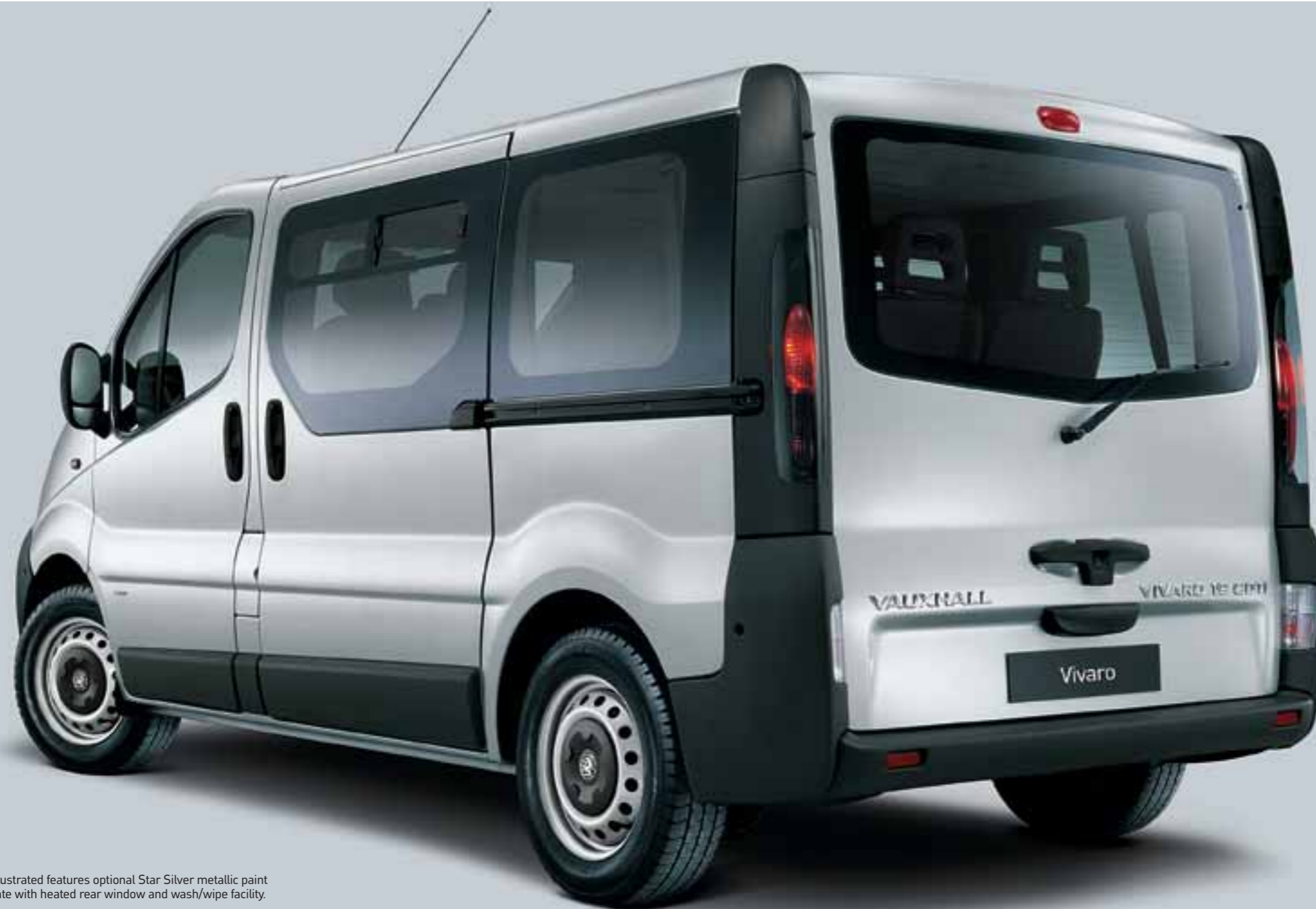
Vehicle illustrated features optional Star Silver metallic paint and tailgate with heated rear window and wash/wipe facility.

Making every journey a pleasure, the Vivaro Minibus features smart Gateway cloth seat trim, full-height side mouldings, saloon lighting, and full-length panelled soft-trimmed headlining. The bonded rear safety glass is tinted, and two top sliding side windows provide added rear ventilation.