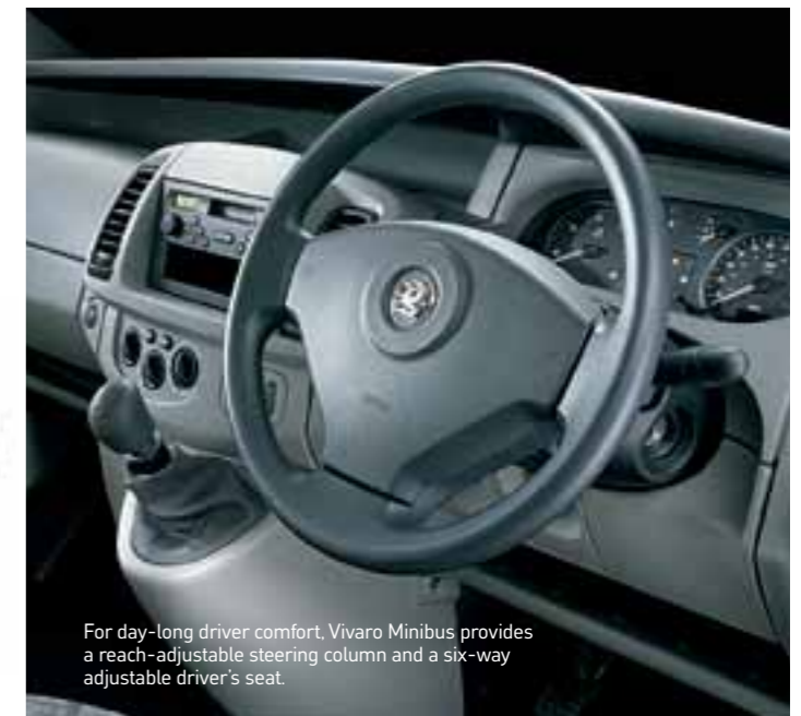
For day-long driver comfort, Vivaro Minibus provides a reach-adjustable steering column and a six-way adjustable driver's seat.